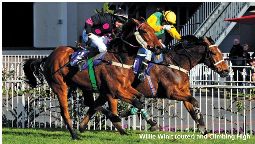
Willie Winit (outer) and Climbing High