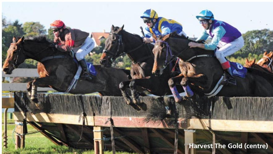
Harvest The Gold (centre)